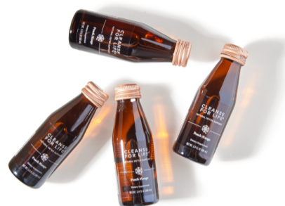
1-Day Cleanse for Life® Starter Set

Be sure to share this wonderfall feeling with everyone.